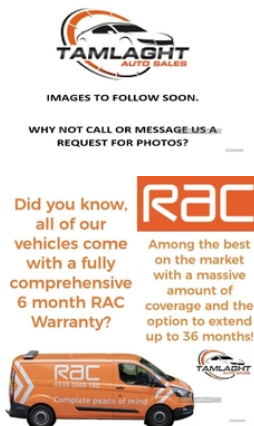
Audi Q2 1.0 TFSI SE 5dr